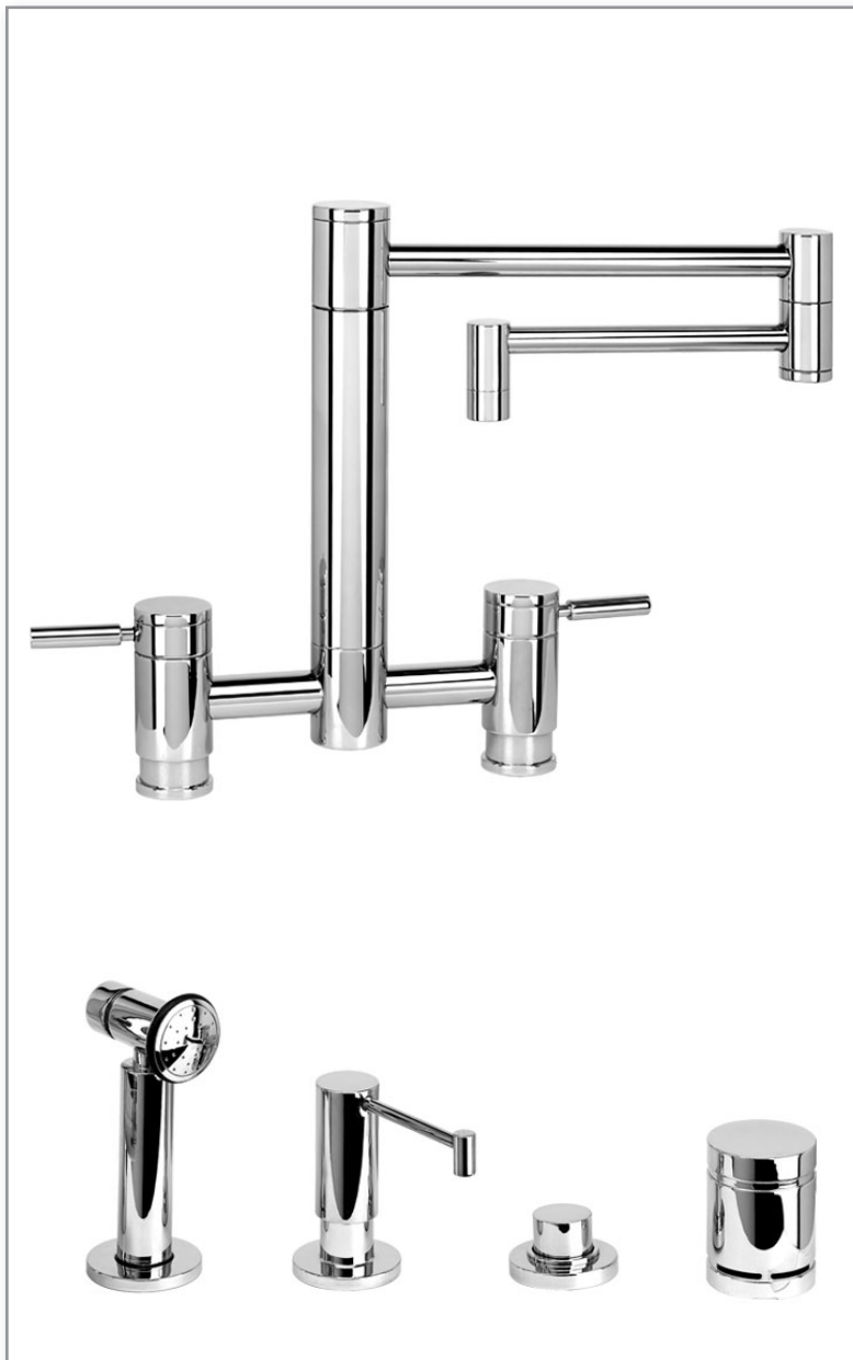
Finish Shown - Chrome