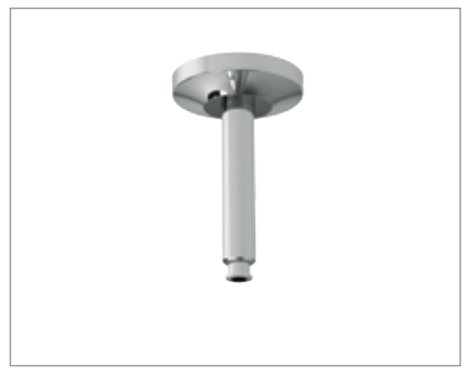
TS110MC6: Rain Shower Arm Ceiling Mount 6"