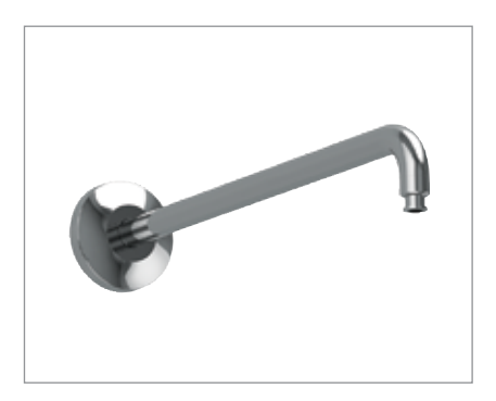
TS110MW16: Rain Shower Arm Wall Mount 16"

Please note the following components are sold separately