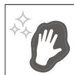
EASY CLEAN FINISH