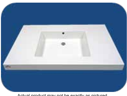
Actual product may not be exactly as pictured.

36<sup>3</sup>/<sub>8</sub>" x 22<sup>1</sup>/<sub>4</sub>" x 1<sup>5</sup>/<sub>8</sub>"