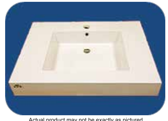
Actual product may not be exactly as pictured.